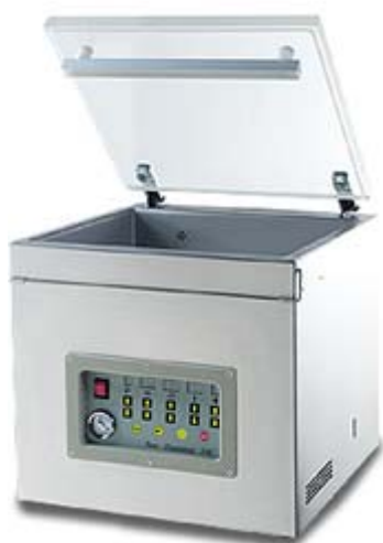
TABLE TOP AUTOMATIC VACUUM MACHINE : J-V002